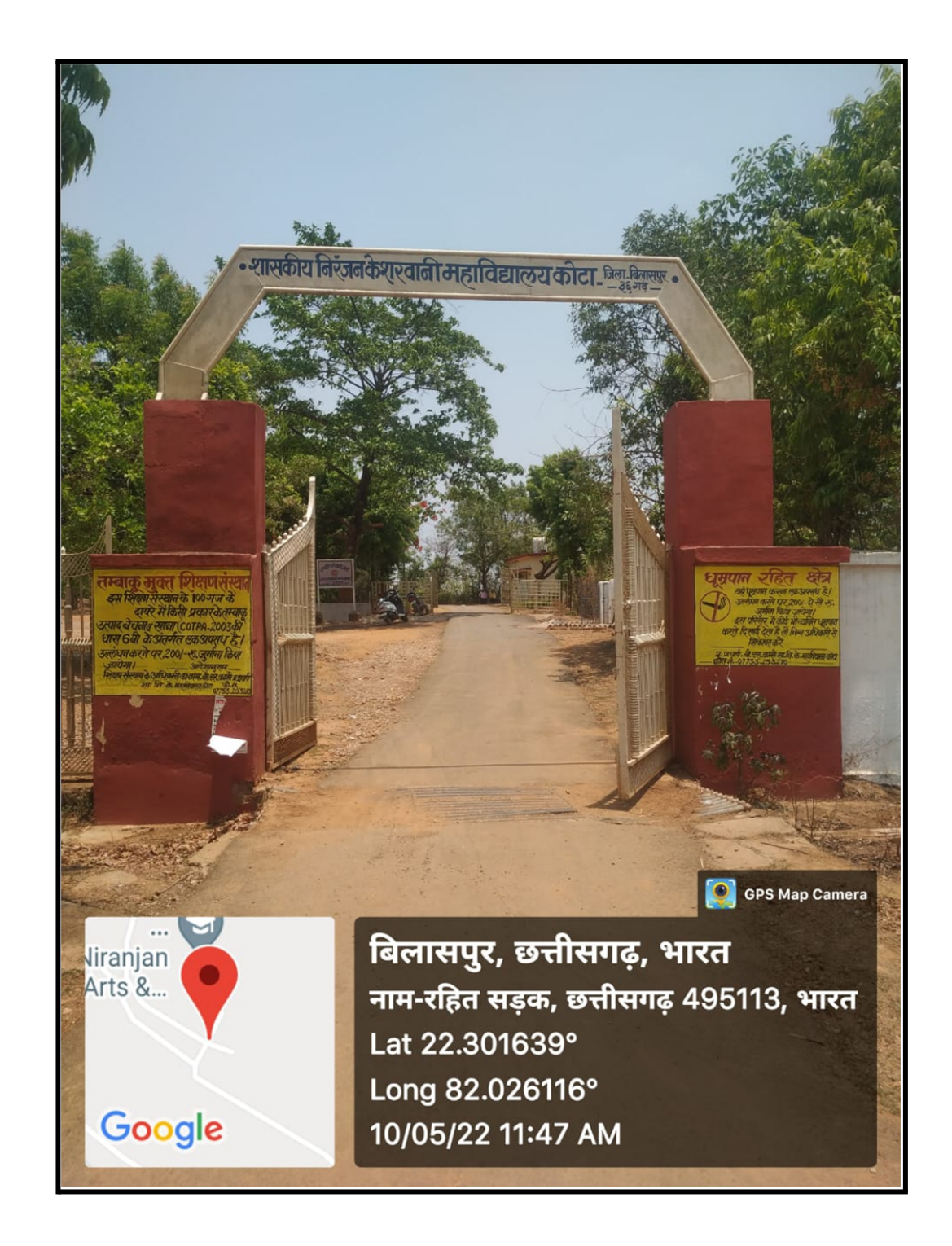
PEDESTRIAN FRIENDLY PATHWAYS